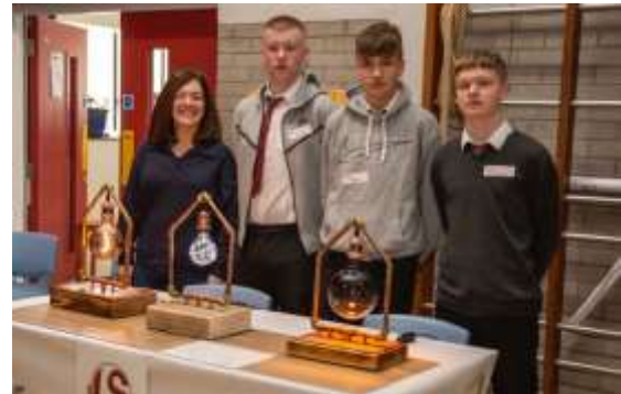
Longstone School, Team B