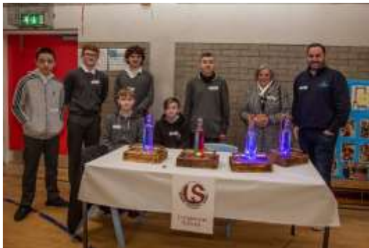
Longstone School, Team A