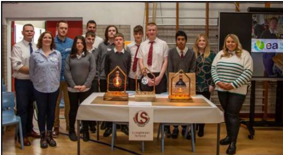
Judges pictured with the winners.