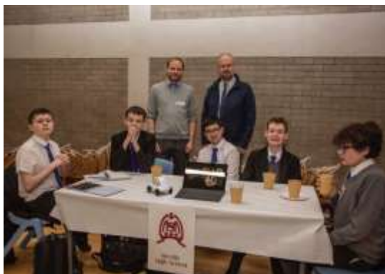
Movilla High School