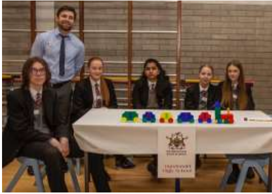
Dundonald High School